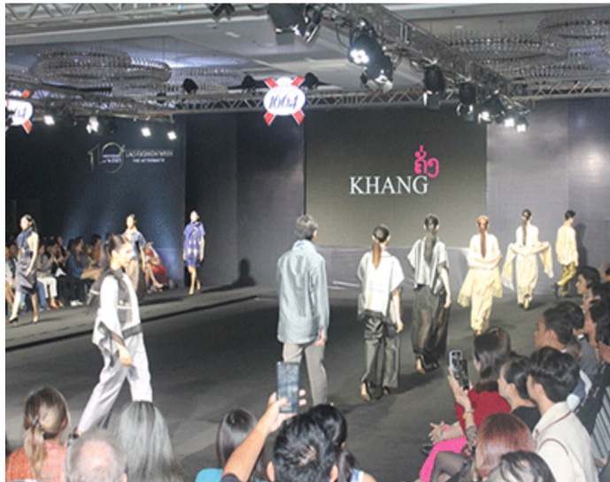
Collections being unveiled on the runway.

the event this year after a long break due to the COVID-19 pandemic.