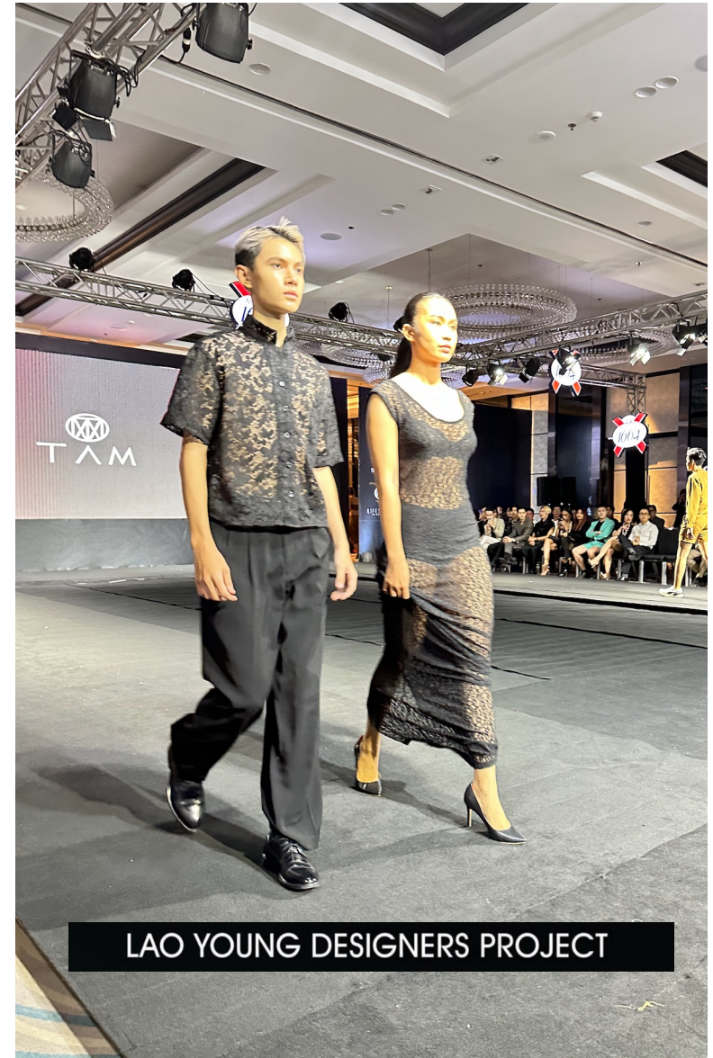
LAO YOUNG DESIGNERS PROJECT

○本年はLFW Board Memberに昇格したが、今後LFW、LYDP共に協力関係を確固たるものにしていくためには、ラオス側との理解と協力が不可欠であるため、主催者側とのコミュニケーションさらに強化していく所存である。