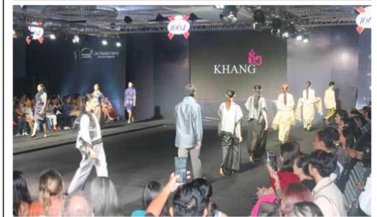
Collections being unveiled on the runway.