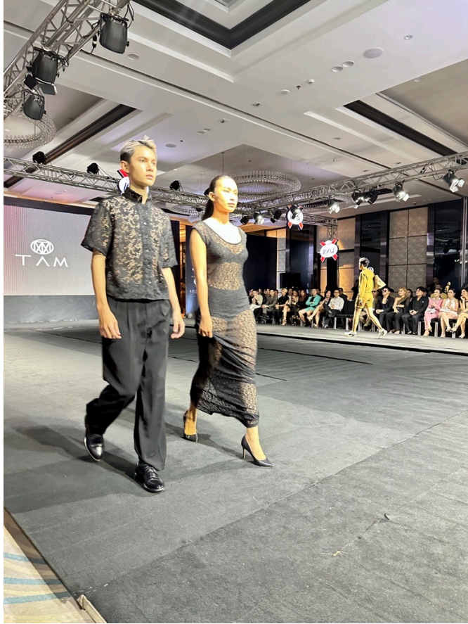
TAM (LAOS) Young Desiner