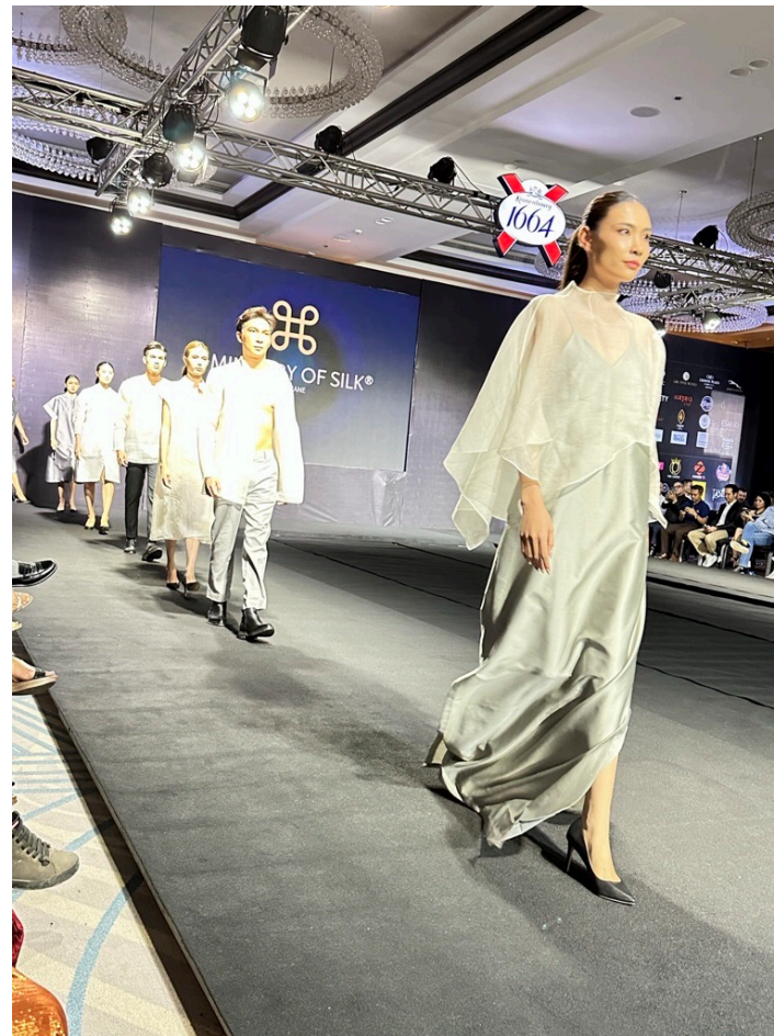
MINISTRY OF SILK(LAOS)