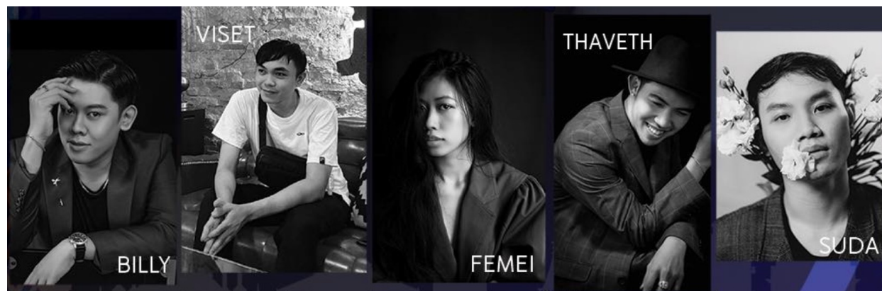
Lao Young Designers